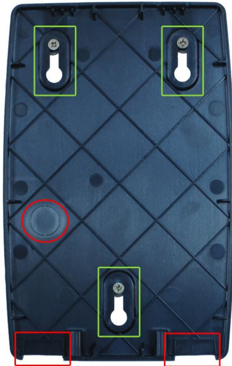
Back plate showing key holes in green and breakouts in red